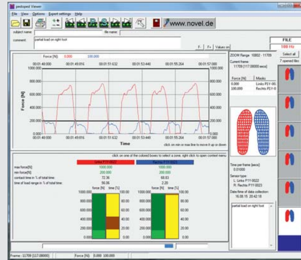
Evaluation of pedoped® measurement on a Windows PC