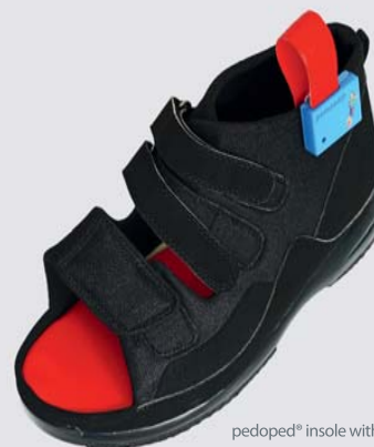
pedoped® insole with electronics

The measurement rate of the pedoped® insole can be user-defined. The raw data are available so that users may program their own applications.