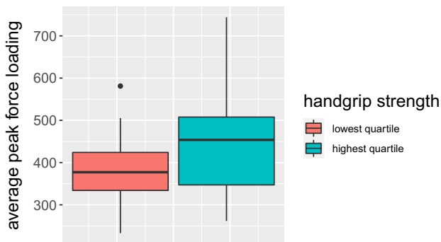
Fig. 2 Boxplot presenting average peak force loading (N) for lowest/highest quartile of handgrip strength